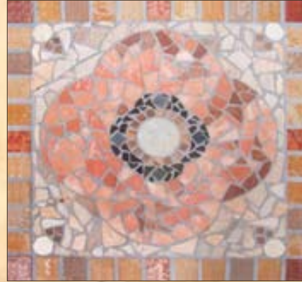
Mosaic table made of reclaimed tiles