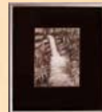
"Rainforest Green" Reem Rahim