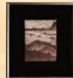
"Morning Rise" Reem Rahim