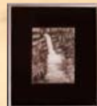
"Untitled" & "Rainforest Green" Reem Rahim